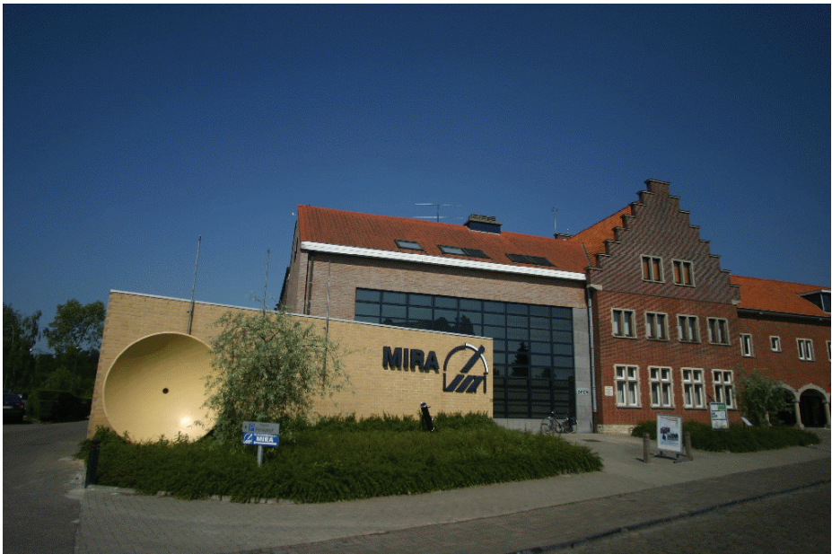
MIRA-Sternwarte Grimbergen

Informationen und Anmeldung unter www.EVS2019.be